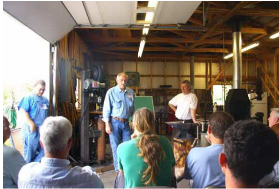
Starting a monthly meeting with announcements and introductions