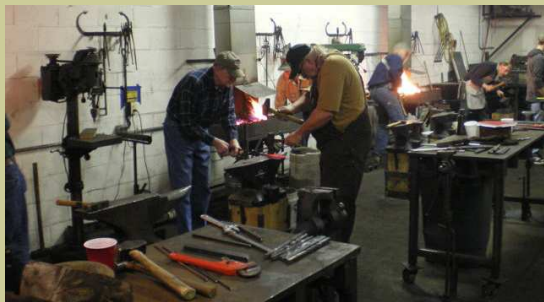
Hands on training event at Virginia Institute of Blacksmithing

All Monthly events will be held the Second Saturday of each Month except December (no event will be scheduled for this month). Some of our events offer hands-on training for those that want it.