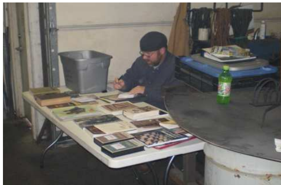
ODBSA Library has books, videos, and DVD's to check out

By hammer and hand all the world does stand